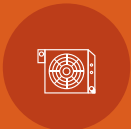
Remote Radiator Applications