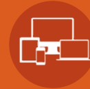
Remote Monitoring System