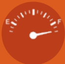
High Capacity Fuel Tanks