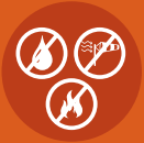
Special Insulation Options