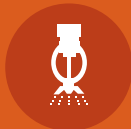
Fire Extinguishing and Protection System