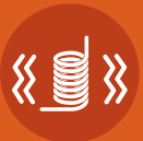
Vibration Dampening Systems