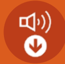
Super Silent Cabinets