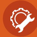
Service Maintenance Packages