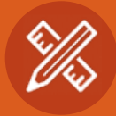
Tailor-made System and Panel Designs