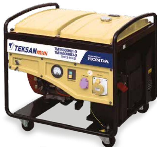
TM15000HB1-O / TM16000HB3-O

Thanks to their compact and durable designs, high performance with low fuel consumption and different power output options, Teksan Mini products deliver more than you expect. Furthermore, you will always find our strong spare parts and service support with you.